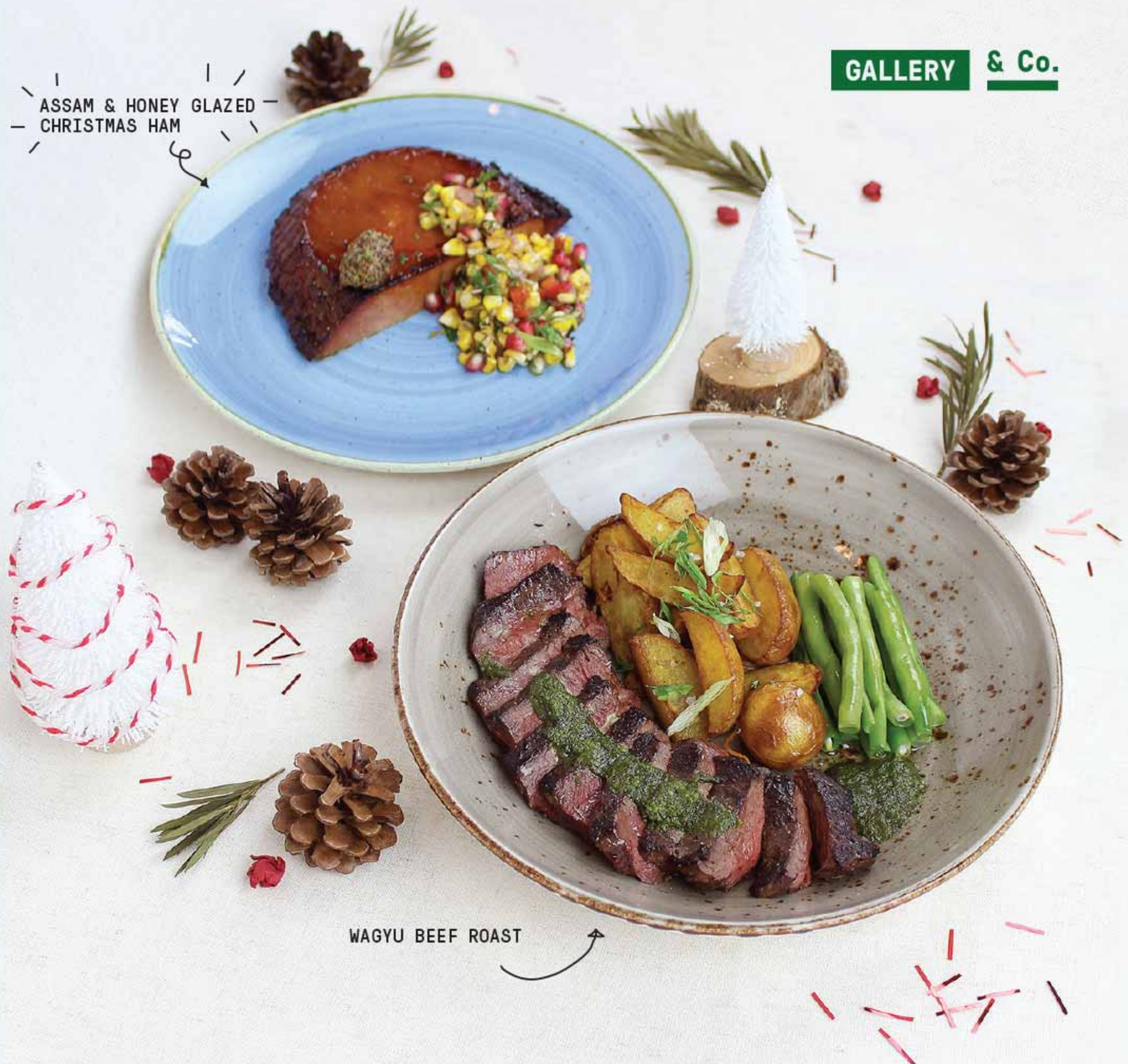
ASSAM & HONEY GLAZED CHRISTMAS HAM