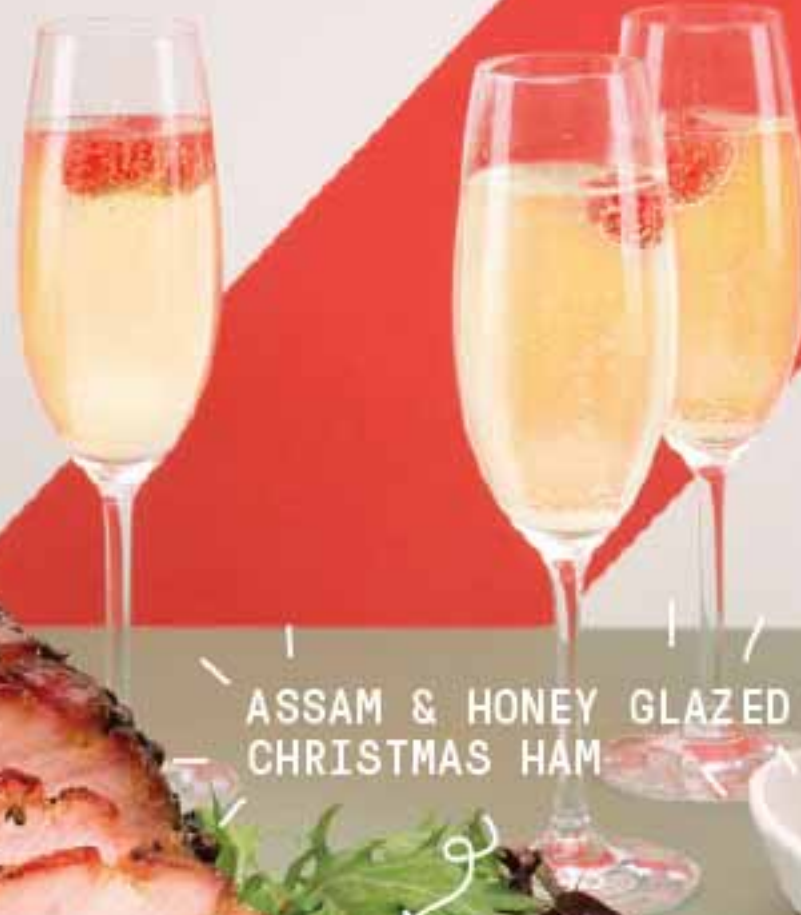
ASSAM & HONEY GLAZED CHRISTMAS HAM