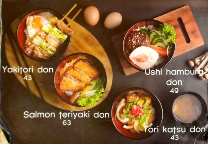
Yakitori don 43