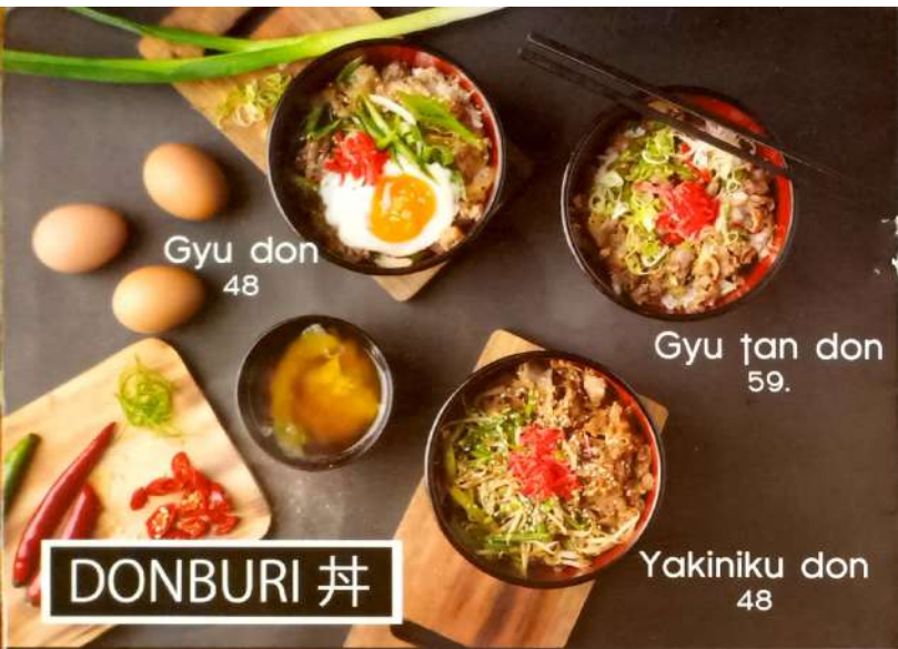
Gyu don 48