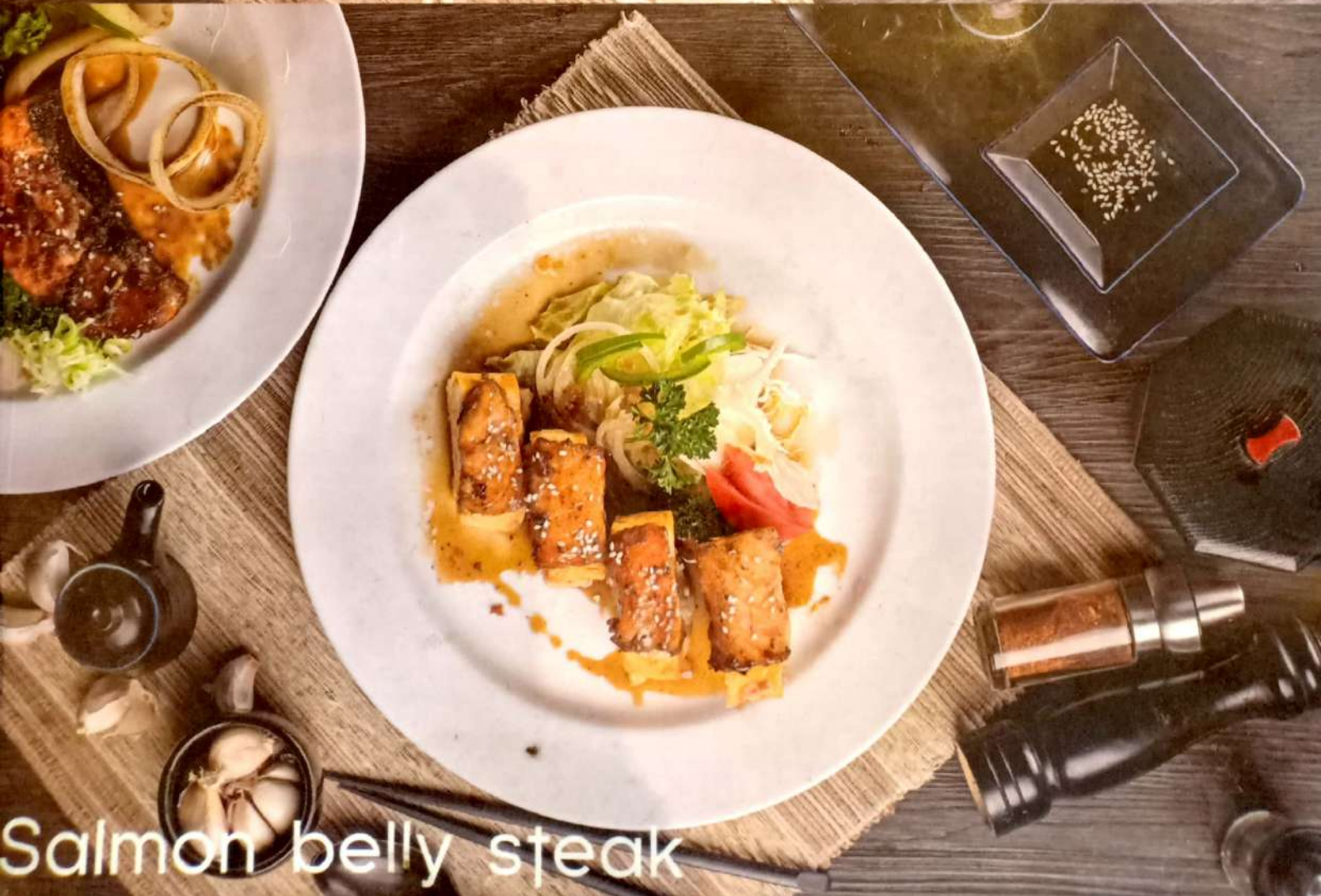
Salmon belly steak